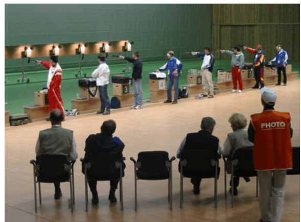
Athens - 2004