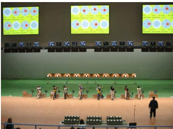
Athens - 2004